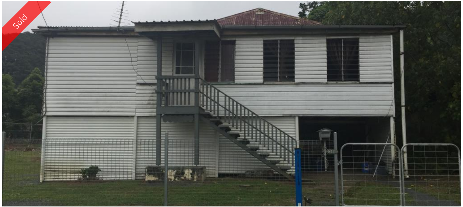
38 Mcquillen St, Tully