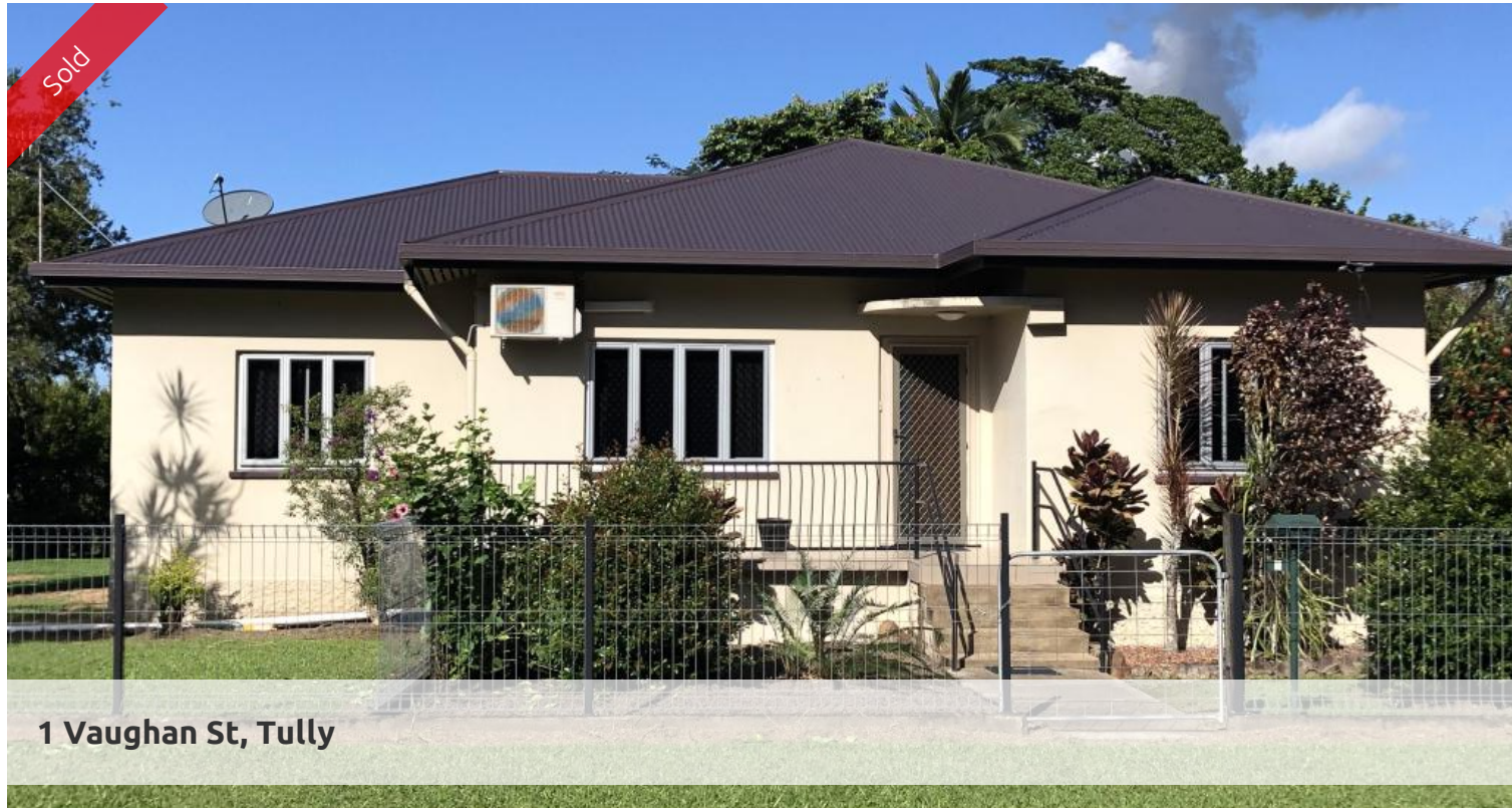
1 Vaughan St, Tully